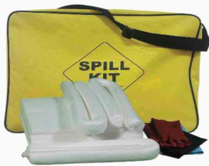
OIL SPILL KIT