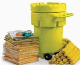
CHEMICAL SPILL KIT