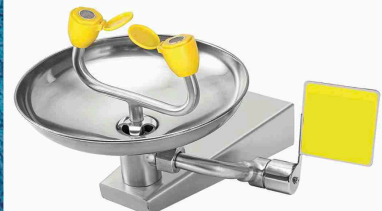
EYE WASH STATION